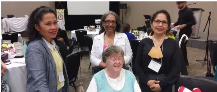
Members from St. Maria Goretti and St. Boniface at Provincial convention

There are approximately 258 million widows globally with increases due to the COVID-19 pandemic and world conflicts. Widows have historically been left unseen, unsupported and unmeasured in our societies. Include widows in your daily activities. ( un.org/en/observances/widows-day )