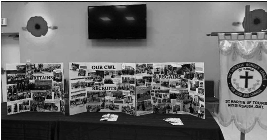
Membership Drive information table at St. Martin of Tours, Mississauga

At our last zoom meeting in February, we reviewed the role of the Chairperson of Social Justice for newly elected members of your council executive, discussed Human Trafficking Awareness Month (February), and other topics. If there is no Social Justice Chair on your council executive, do not be deterred, as anyone interested in Social Justice issues is welcome to join in these meetings. Please note our next zoom meeting is scheduled for April 9, 2025 at 7.00 pm.